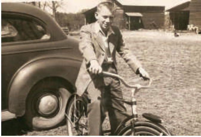
My new bicycle which I received for Christmas. Later I wrecked it racing downhill on a winding dirt road leading from Dash Gaither's store to Hunting Creek and severely skinned up both legs and one arm.