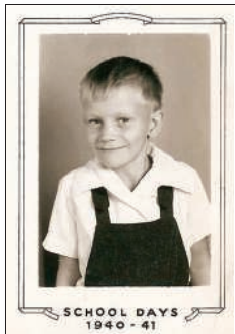
School days at Jonesville Elementary.

Moving to the farm, which was located in Iredell County, meant a change of schools. I had finished second grade at Jonesville and would be entering third grade at Union Grove School five miles northwest of the farm. The school took its name from the small community of Union Grove, which had a post office, a church, two gas stations, a cotton gin, a feed mill, and eleven homes. One of the two main school buildings housed grades one through eight, the other, grades nine through twelve. The brick buildings were steam heated in winter. Open windows provided some cool breezes in spring and fall. The school grounds were dotted with red and white oaks and maple trees, a baseball diamond, a volleyball court, and a clapboard basketball gym.