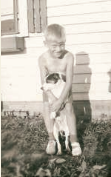
Me and my dog Nicky at our home in Arlington, about four miles south of Elkin. One day our house burned down. The only thing I recall that was left was a little ceramic house with a slot in the top to be used as a bank. It was partly melted with a coin inside when I found it.

to formally dedicate an American treasure, the Great Smoky Mountains National Park. The park was created in 1934 during the Great Depression, and the CCC, WPA, and others had been working on facilities ever since. Today the park is the most visited national park in the country.